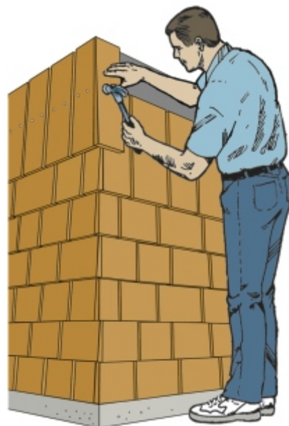
Figure 9: Fitting Laced Corner Courses