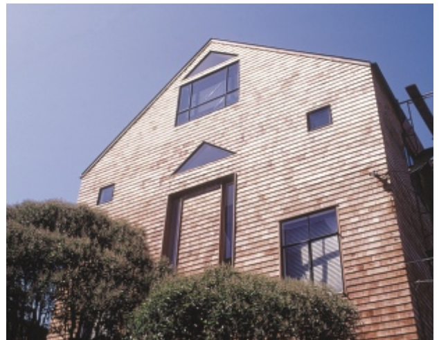
Architect: Tanner and VanDine Architects