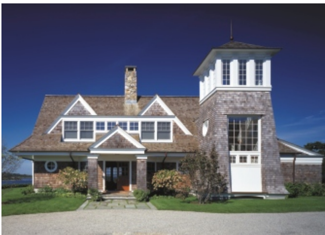
Figure 6: Single Coursing

Architect: Shope Reno Wharton